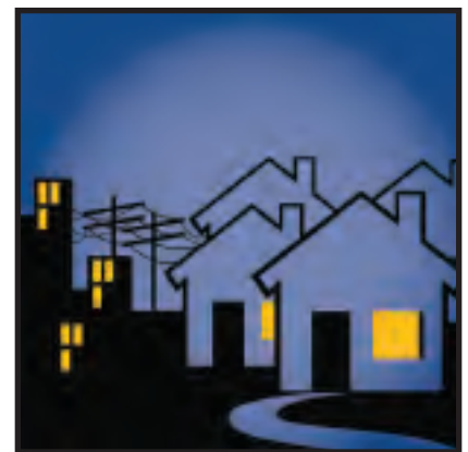
Example of a local distribution system.

Generation is the production of electricity at a power plant. Like any other product you buy, electricity must be made. In the District of Columbia, electricity suppliers who produce electricity may compete for your business. You can choose who generates your electricity. There are currently a limited number of suppliers, but more choices may become available in the future.