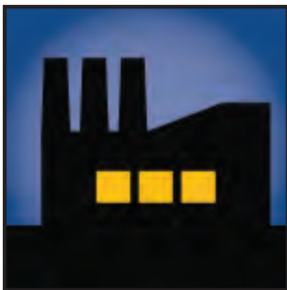
Example of a power plant.

Your electric bill contains three separate charges for the three parts of your electricity service — generation, transmission and distribution . Because the District of Columbia's electricity market is open to competition, you have the ability to choose who supplies the generation service portion of your service — this is called customer choice . Like buying any other product, it's important to be informed about what you are purchasing — the same goes for buying electricity.